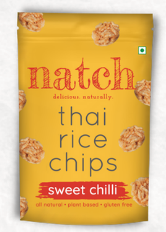
Net Weight - 100g