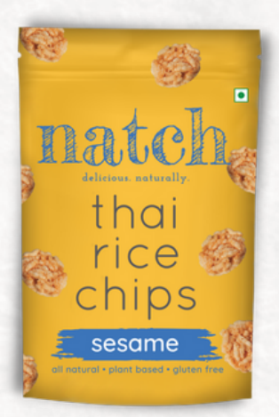
Net Weight - 100g