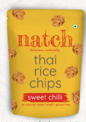
Net Weight - 25g