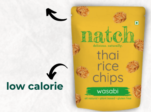
Net Weight - 25g